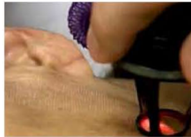
A high-energy laser beam is applied in a fractional pattern over the surface of the treatment area, leaving areas of untouched skin to promote quicker healing.